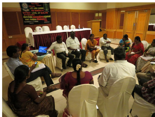
Discussion with L3F Stakeholders

VIDIYAL assisted to prepare the NGO Partners Business proposals and to submit their members credit applications to all the Banks.