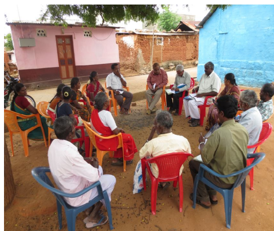
Review of VWC by NABARD Officials

From 2005- 2010 executed watershed activities at T.Meenakshipuram with the Farmers participation. Vidiyal has developed Village watershed Committee (VWC), maintenance Committee for watershed structures, Livelihood forum for the Landless groups and Community Milk collection Centre maintained by the User groups. To support the farmers Vidiyal has got loan of Rs.10,00,000/- under water Plus activities in 2012. The loan was distributed through the VWC for 53 members for their microenterprise activities such as Goat and Milch animal rearing.